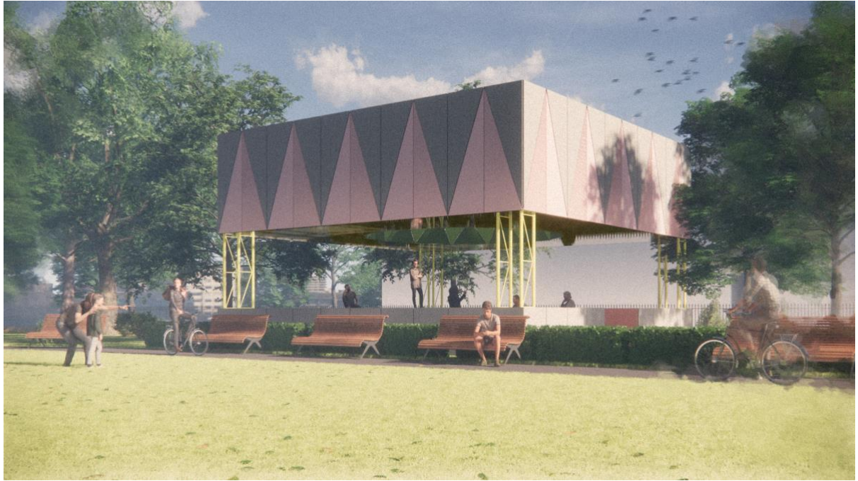
Render of Conversations at Clerkenwell Talks Space

Conversations at Clerkenwell has always been a highlight of the show, with a specially designed venue in Spa Fields. Designed by Fieldwork Architects, the concept for the CDW 2022 talks space reimagines the traditional Victorian bandstand as a focal point within the park, a place for gathering, discussion, entertainment and shelter. Rather than a traditional forward facing seating arrangement, the nature of the bandstand form allows the focus point to be partially in the round and engage the audience as a discussion, rather than a presentation. As a place for debate, the talks space is required to be both inward and outward looking. The mass of the bandstand has been inverted within a solid cube, focussing attention and sound on the speaker via a centrally located geodesic formed dome and circular seating below.